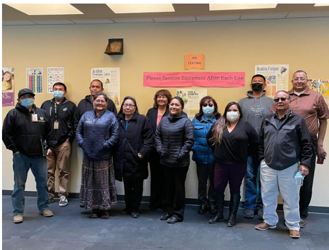
Creating a Pathway to Wellness work session attendees pictured at the Hard Rock Wellness Center.

“Each of our social service programs have done good work to serve the needs of our Navajo people and our families,” said Navajo Nation President Buu Nygren. “Let’s work together with our local communities to make sure we’re always improving service delivery because this is part of supporting our homes and communities here on the Navajo Nation.”