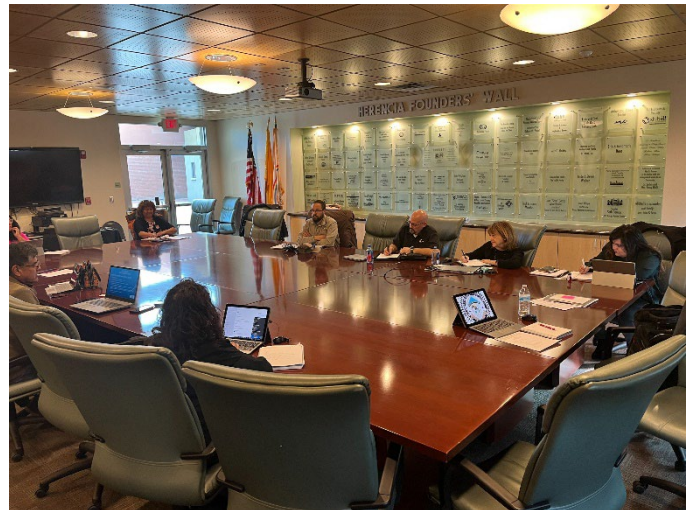
NDSS electronic case management database meeting.

NDSS will host its contracted domestic violence shelters on Feb. 21 in Shiprock, New Mexico, to share a major announcement and to hear from shelters directly. The NDSS contracts with 7 shelters, collaborates with one in Blanding, Utah, and operates one in Shiprock. The Office of the Executive Director will release updates as they become available.