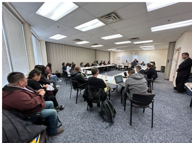
Shelter Home Directors and staff work session to share challenges and solutions regarding their contracts with NDSS.